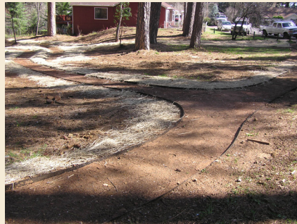
Erosion control and path construction

The Condon Park project benefits the community of Nevada County. Due to the overgrowth of the invasive species in this portion of the park, the area was not accessible by the public. To enable people to learn about native and non-native plants, wildlife habitat, erosion, and