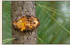
Tree Diseases and Forestry Health