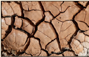
How to Test Your Soil

As part of our outreach effort we continued to offer Deer Whistles to the community and hosted eight seminars as part of our Fall 2012–Spring 2013 Seminar Series . Topics included: