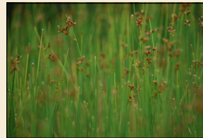
Using Native Grasses in the Meadow, Pasture, and Landscape