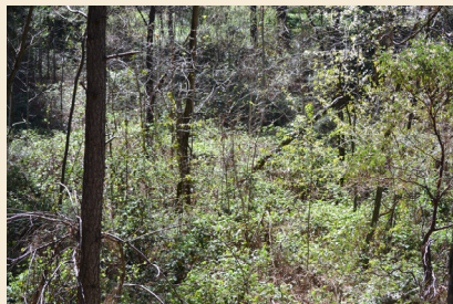
Condon Park project—before

In partnership with the City of Grass Valley, this project addresses the removal of invasive species, restoration of wildlife habitat, improvement of forest health, installation of