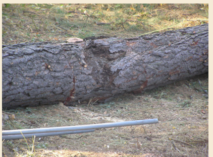
Ponderosa Pine with Western Gall Rust damage

conservation through education, recreational land restoration, soil and water management, urban resource conservation, wildlife habitat enhancement, and much more.