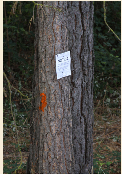
Dead and diseased trees marked for removal

vision to educate and assist landowners and land managers in establishing a balance between a high quality rural environment, a biologically diverse landscape, and a healthy economy for the community of resource