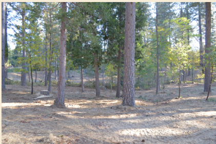
Grading & contouring

The project consisted of identifying invasive species and marking for removal; spraying the invasives; cutting down the dead and diseased trees; removing the vegetation; creating paths; controlling erosion; installing fencing; and creating interpretive signage.