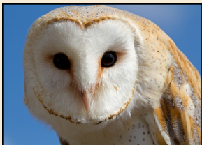
Forest Raptors of Nevada County