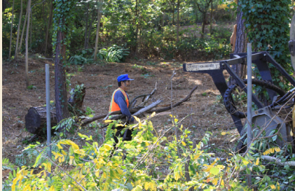
A member of Trees Unlimited's crew removing vegetation

NCRCD worked with the City of Grass Valley, NRCS, Sierra Pacific Industries, and others.