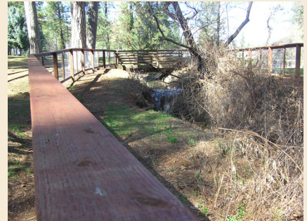
Fencing & erosion control