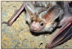
Northern California Bats