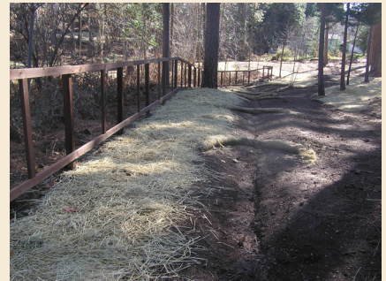
Erosion control and grading

Long term goals are to increase botanical diversity of native plants by removing competitive invasives, to improve wildlife habitat, to improve the forest stand for fuel reduction and forest health, to help stabilize erosion of Peabody Creek, and to increase the recreational value of Condon Park.