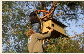
Where to Place Your Nesting Box