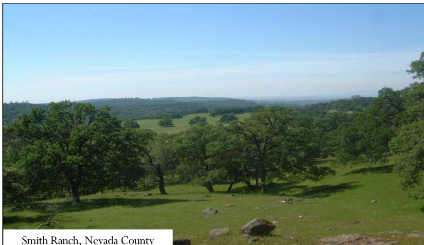
Smith Ranch, Nevada County