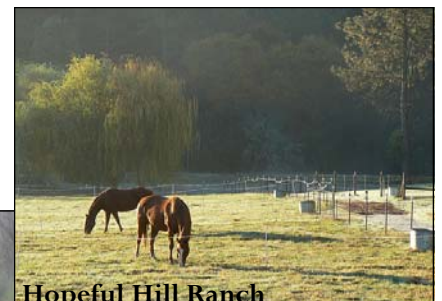
Hopeful Hill Ranch