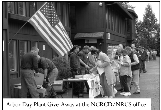
Arbor Day Plant Give-Away at the NCRCD/NRCS office.

Wildlife boxes were also be available for purchase, and we supplied free information on many resource conservation topics.