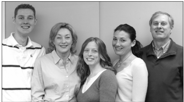
NCRCD & NRCS Staff